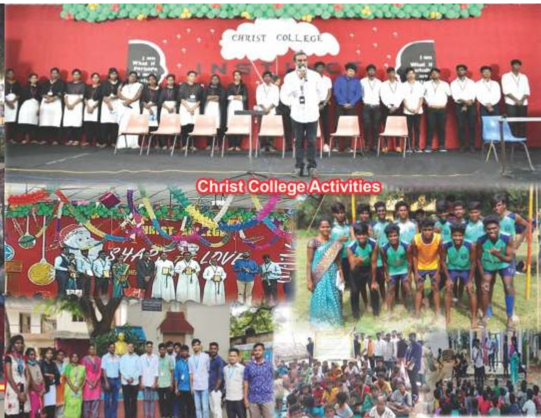
Christ College Activities