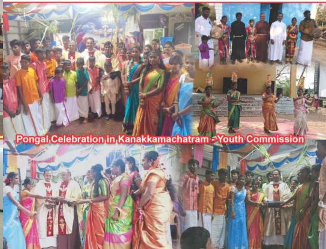
Pongal Celebration in Kanakkamachatram - Youth Commission