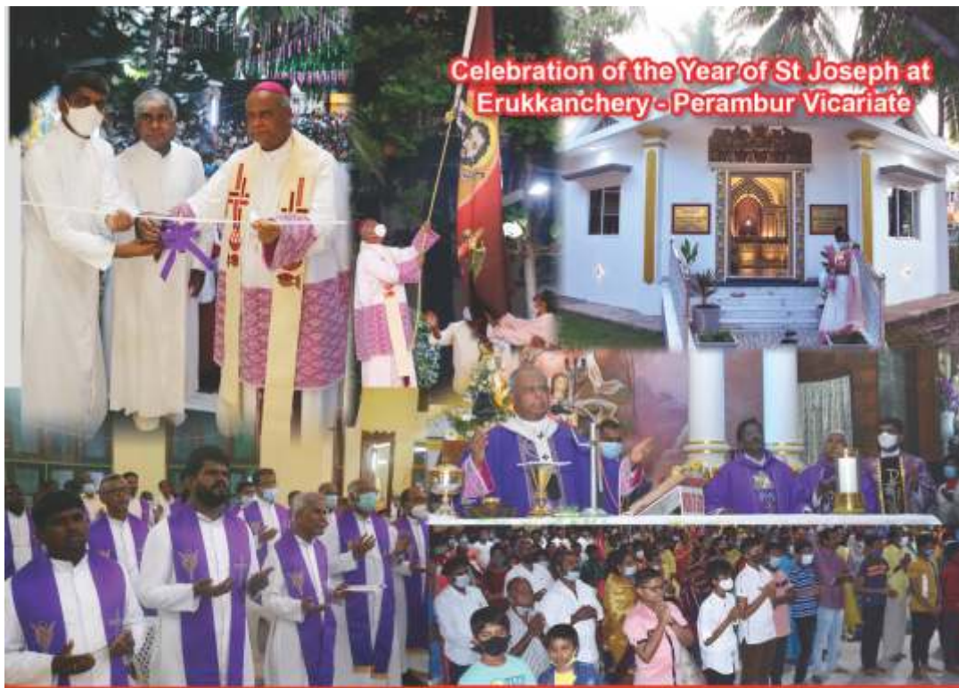
Celebration of the Year of St Joseph at Erukkanchery - Perambur Vicariate