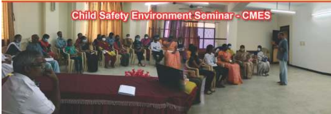
Child Safety Environment Seminar - CMES