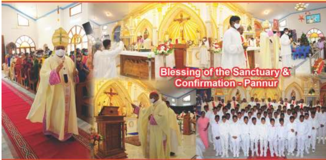
Blessing of the Sanctuary & Confirmation - Pannur